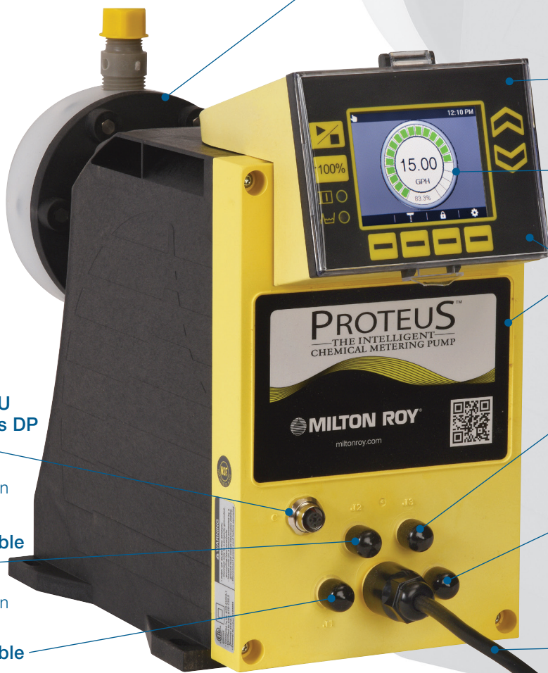
Pictured: Communication model