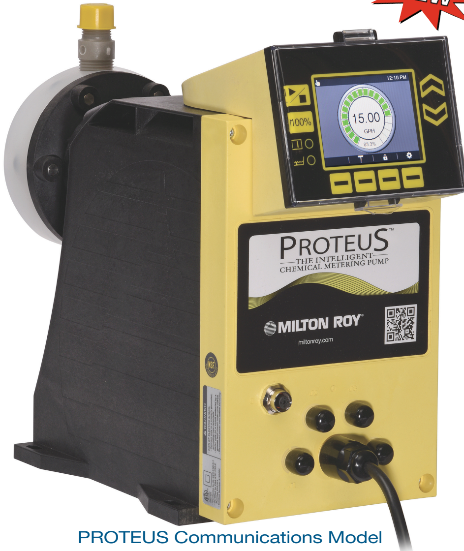
PROTEUS Communications Model